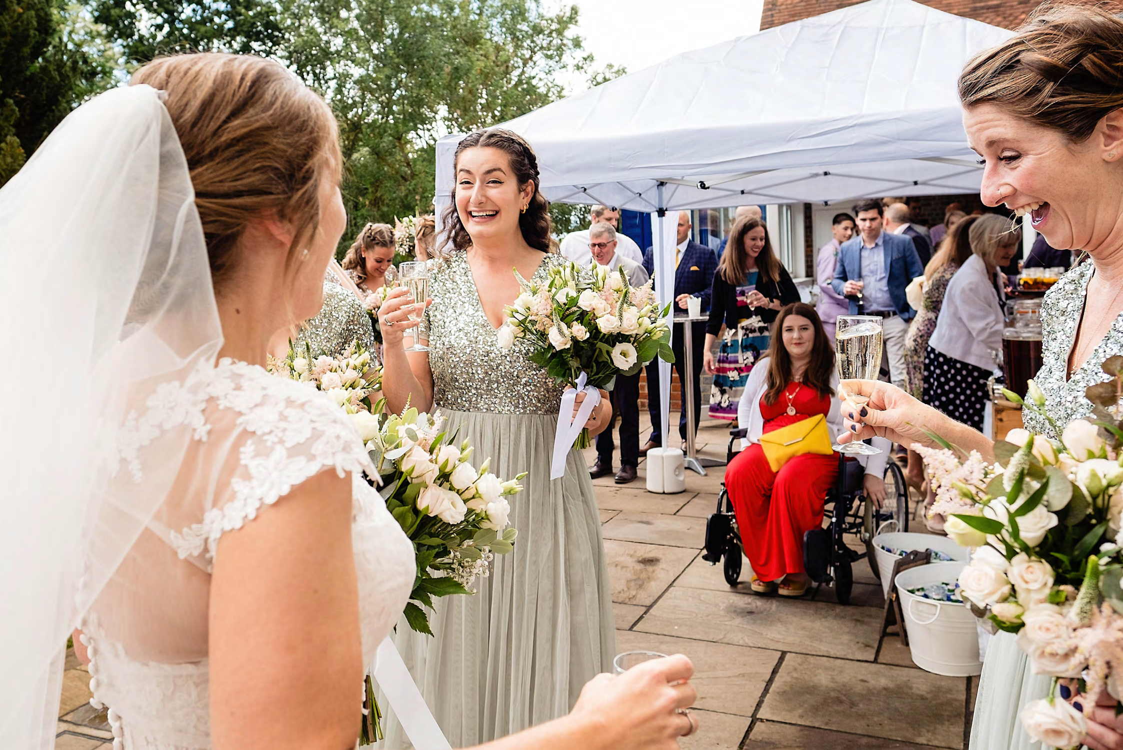
The building has a lovely new terrace which is accessed from double doors off the main hall