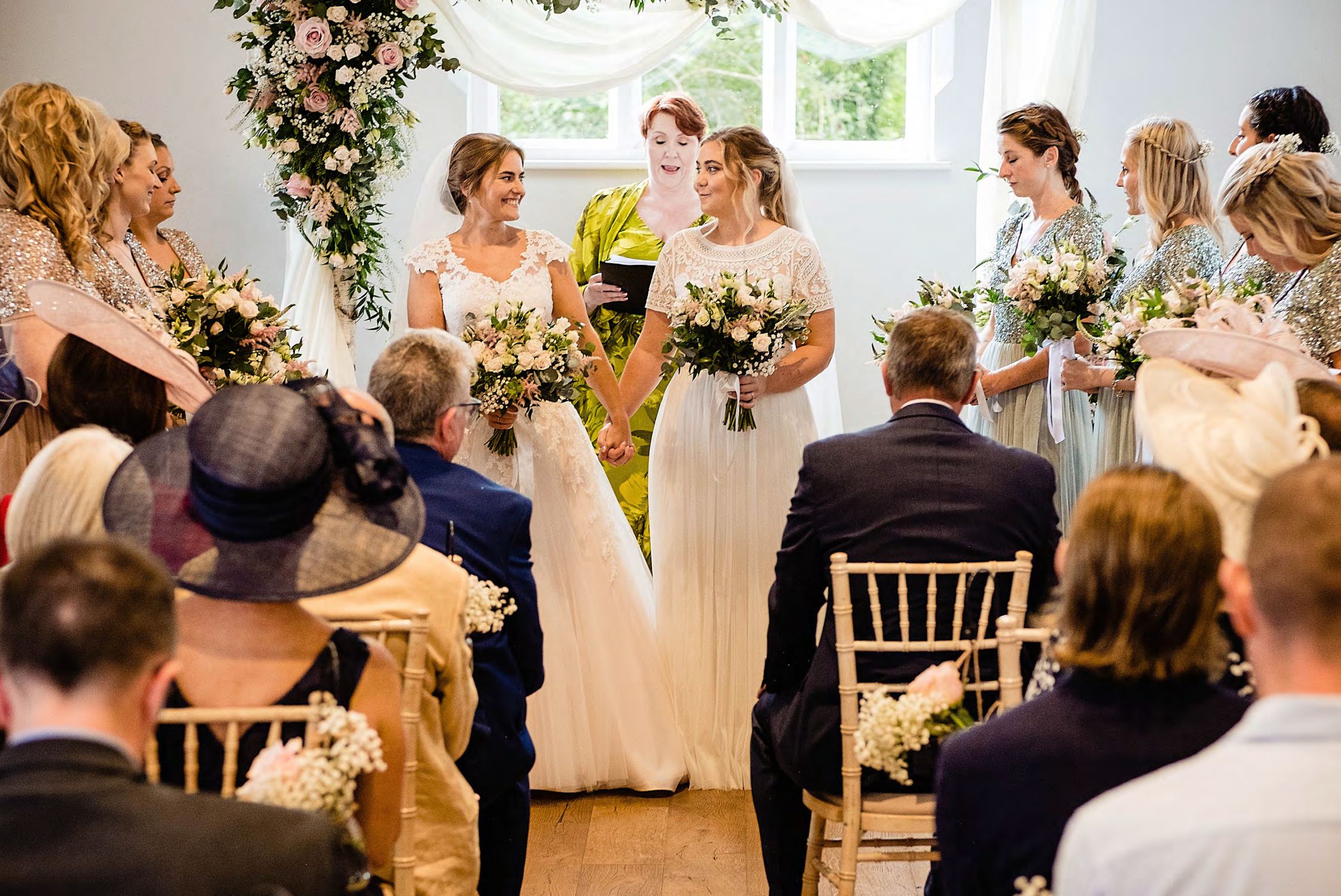
We expect to be fully licensed for weddings soon, but in the meanwhile the hall is a popular venue for blessing ceremonies