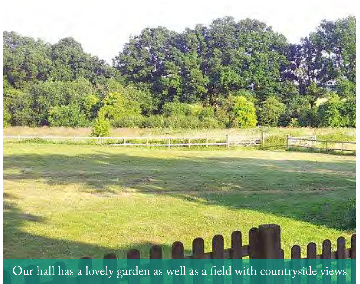
Our hall has a lovely garden as well as a field with countryside views

“Thrilled with the venue... everything we hoped for and more besides...made the whole day incredibly special”